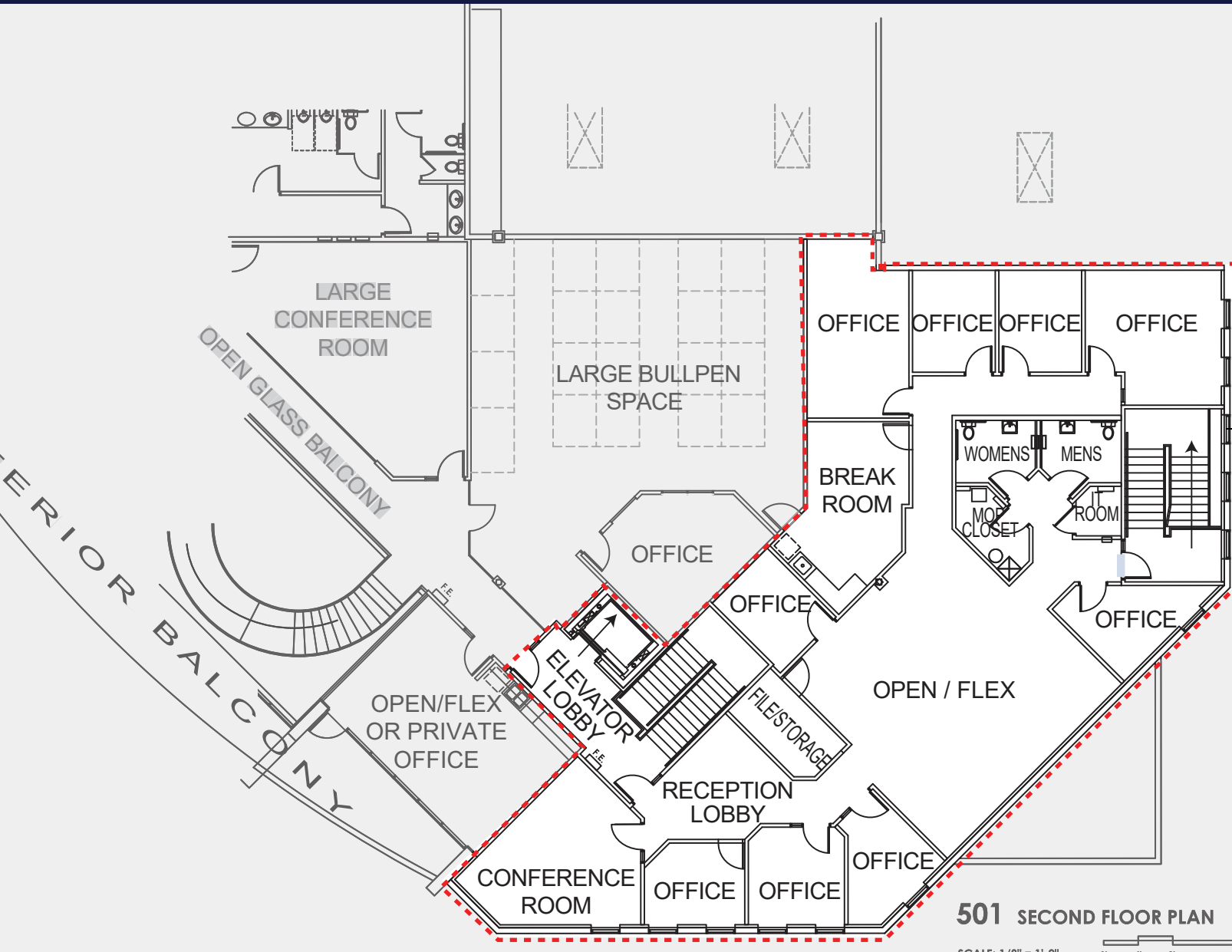
501 SECOND FLOOR PLAN

9160 E BAHIA DRIVE | Scottsdale, Arizona 85260